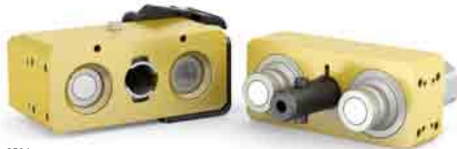
Multi-X Duo 25 - Unique Multi solution for two lines

CEJN Multi-X Duo 25 is a multi-connection plate with 2 ports, size DN25. All plates are designed with spill free Flat-Face couplings according to ISO 16028. Nipples with integrated pressure eliminators ensure smooth connections even with high residual pressure. Working pressure of up to 350 bar can be used on half the ports simultaneously with the other half of the ports used as return lines with a maximum pressure of 50 bar. For optimal flexibility both the male and female plate can be used as the fixed part and each plate can also be outfitted with electric connectors.